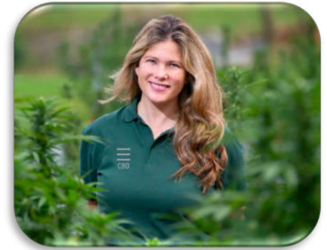
dwell CBD products are all proudly grown and formulated in KY!

At dwell CBD™ we take the science of hemp-derived cbd and cbd-infused products very seriously. dwell CBD™ is not simply a brand; it's a lifestyle and a commitment to wellness through enriched natural resources and a focus on purity.